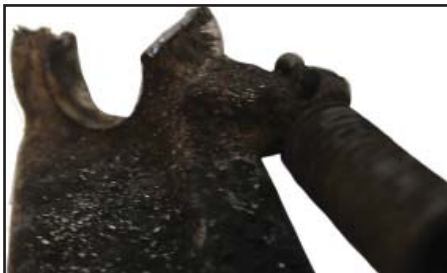
Damaged / Cut Brackets: examples LCA / RCA144, 194, 207, 219

Please ensure that when taking back an exchange caliper, the unit is inspected for damage and rejected at source where necessary.